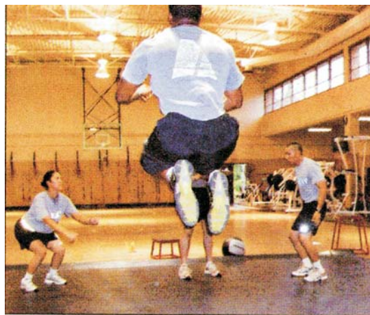
Soldiers in the 101st Airborne Division add new jumping exercises in their training at Fort Campbell, Ky. Many soldiers who went through the Air Assault course were injured in training in the past.

"We put oxygen masks on soldiers in the field to test the demands on them in