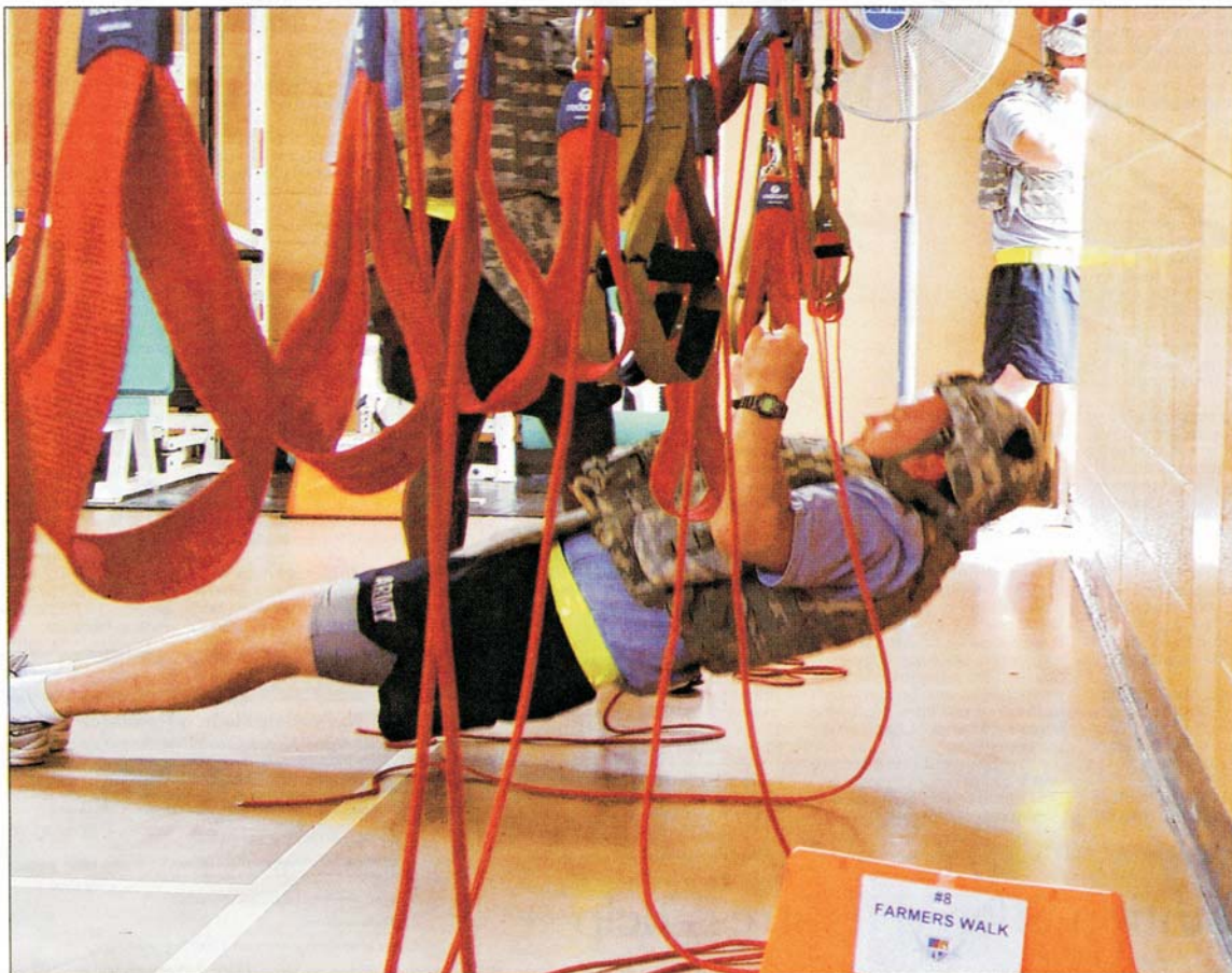
Soldiers at Fort Campbell, Ky., wear helmets and body armor as they work out, using training developed by experts at the University of Pittsburgh Medical Center. The exercises are designed specifically to prevent injuries in training.

WELLNESS, FITNESS, INNOVATION • Pittsburgh Post-Gazette • WEDNESDAY, SEPTEMBER 2, 2009